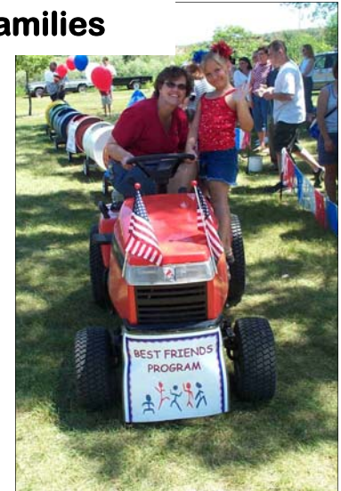
Kids activities like the barrel train (above), horse rides, kids carnival games, dunk tank, jumper castle, giant slide & food concessions are part of the annual Family Fun Day.

Proceeds from Family Fun Day directly sup-