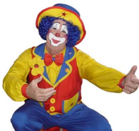
Bodiddly the Clown will debut with fun, games & tricks at Family Fun Day.

The Best Friends Program, provides positive, caring adult role models to more than 150 at-risk youth each year in southwest North Dakota.