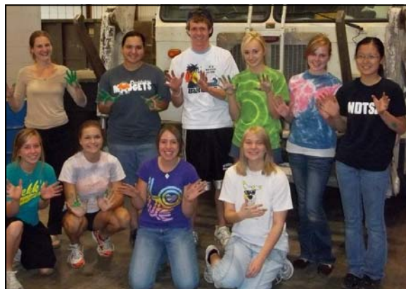
National Honor Society students from Dickinson High School painted four bins for recycling aluminum cans for Best Friends.

In another project, the DHS students recently collected about 50 used cell phones and dozens of accessories for recycling by BFMP, keeping them out of the Dickinson landfill and earning funds for BFMP. To recycle your used cell phone, drop off at the Best Friends office at 135 W. Villard St.